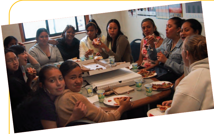
Talking Circles is a project of St John's Educational Thresholds Center. Groups of girls meet to discuss various issues they are facing, and to generate solutions on how specifically to deal with certain social pressures.

"Thank you for supporting this girl's group because where I'm from nobody really cared about how we feel and how could they help others. I am a senior and I'm about to graduate and thanks to you guys you made it possible for me because I had no hope. I was really going through something but I pulled through it"